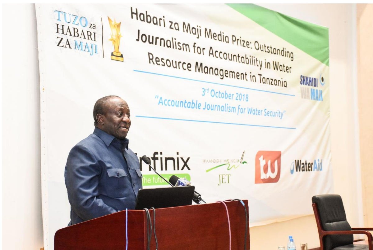
Guest of Honour, Honourable Minister of Information, Culture, Arts and Sports Dr Harrison Mwakymbe delivering a Keynote Speech at the Habari za Maji Awards Ceremony.